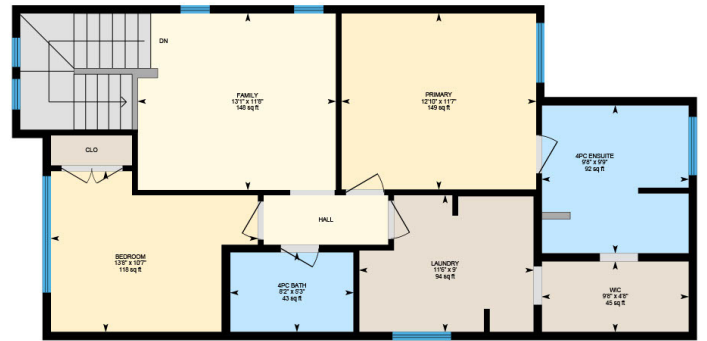
Upper Level Exterior Area 909.54 sq ft Interior Area 837.90 sq ft

White regions are excluded from total floor area in iGUIDE floor plans. All room dimensions and floor areas must be considered approximate and are subject to independent verification.